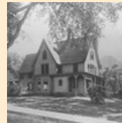
The Charles Treadway House, home of Bristol Library & Reading Room 1896-1906