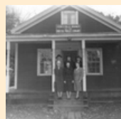
The Forestville Library est. 1904