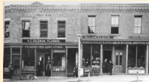
The first location of The Free Public Library opened on Main Street in 1892